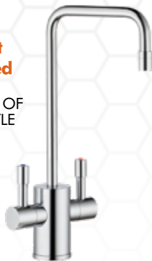
K-T-DUOSQ Squareneck tap option