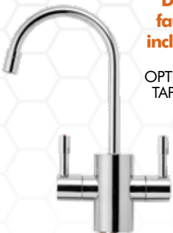
K-T-DUOGN Gooseneck tap option